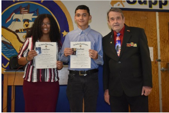
Post 385 presented the School Medal awards to cadets from Charles Flanagan High School.