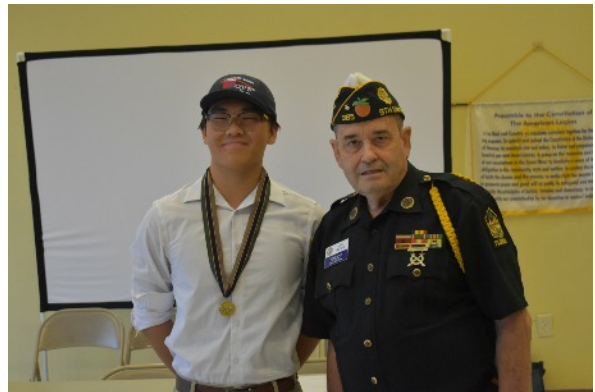
One September 11, 2022 Our Post met for the first time since Covid began at our home at the YMCA, were we held our Installation of Officers by the 9th District staff and presented our two Boys State students with their medallion. Each student spoke about their experience in Tallahassee.