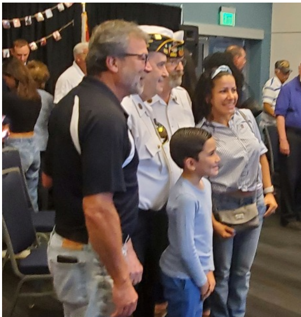
On Friday November 11th Veterans Day our American Legion Post 385 participated in the City of Pembroke Pines, the following photos are courtesy of Patti Good. It's Veterans Day Weekend.