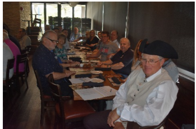
At the June 17, 2023, General Membership Meeting, in attendance were 24 Compatriot members and 10 guests, including two prospective new members.