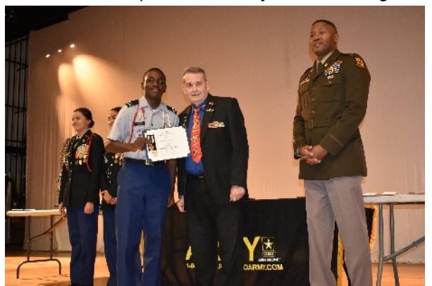
Our Chapter present the JROTC medal to a cadet from Hollywood Highs High School.