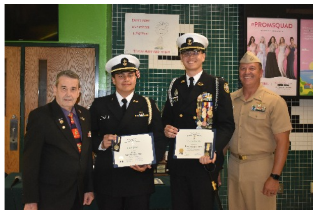
Charles Flanagan High School