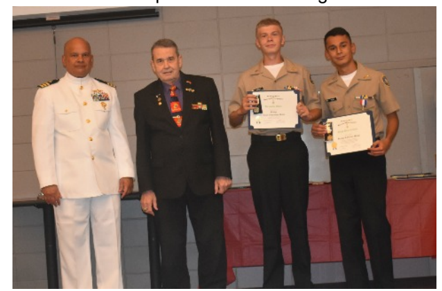
Cooper City High School