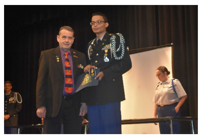
McArthur High School