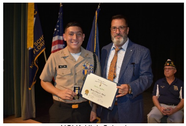
NOVA High School