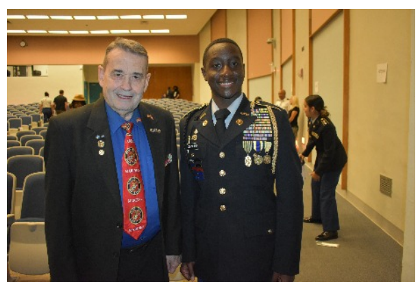
Our 2021 recipient from Hollywood Hills High.