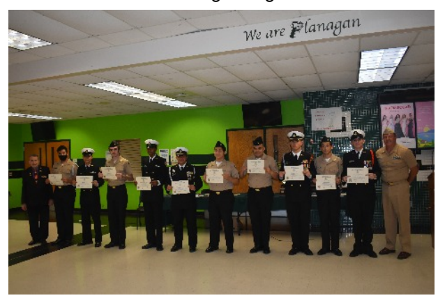
Charles Flanagan High School SAR certificates