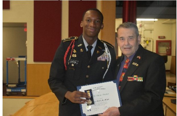
Hallandale High School