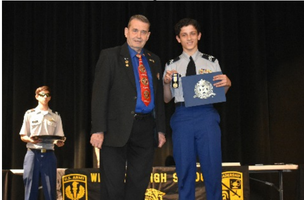
Western High School