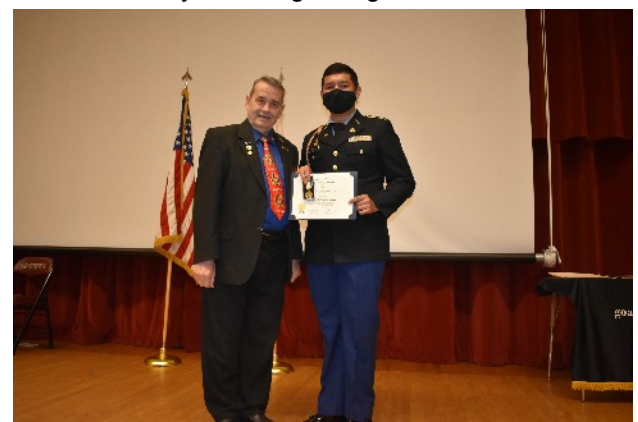
Coconut Creek High School