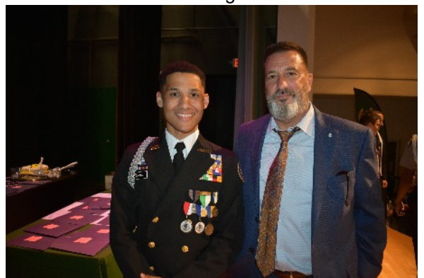
Our 2021 recipient from NOVA High School.