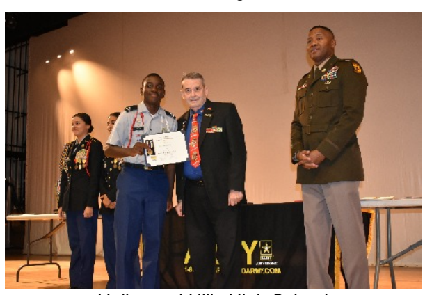
Hollywood Hills High School