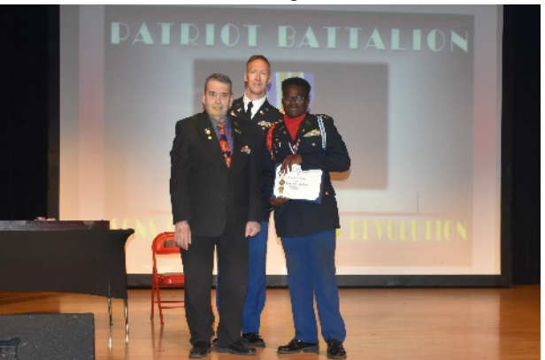
Miramar High School