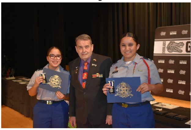
Everglades High School