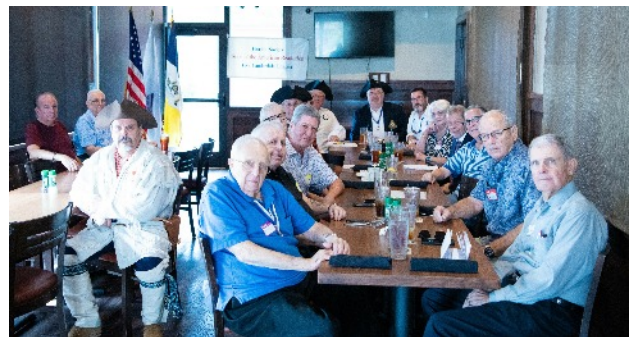
Fort Lauderdale Chapter Compatriots at the October 14, 2024 General Membership Meeting