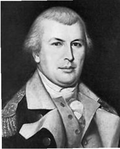
Nathanael Greene, portrait by Charles Willson Peale, c. 1783

George Washington's close friend and most-trusted general, Major-General Nathanael Greene never won a major battle as Commander of the Southern Continental Army yet won the war. Born into a Quaker family in Potowomut, Rhode Island on July 27, 1742, Greene, despite Quaker restrictions on extensive learning, was a self-educated man and an avid reader interested in studying mathematics and law, but his true calling was military science. This passion led to his eventual disownment by the Society of Friends after he attended a military parade in Connecticut and openly supported armed rebellion against England.