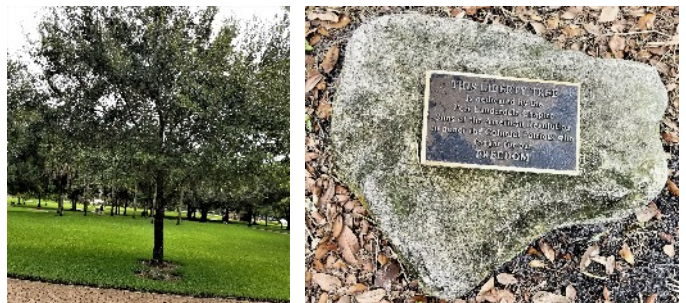
Fort Lauderdale Chapter Plantation Liberty Tree & Plaque