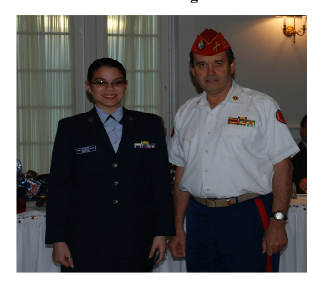
Coral Springs Civil Air Patrol