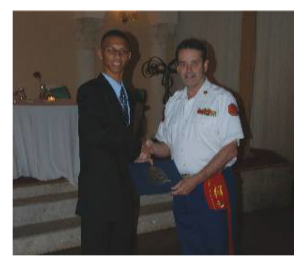
Charles Flanagan High School