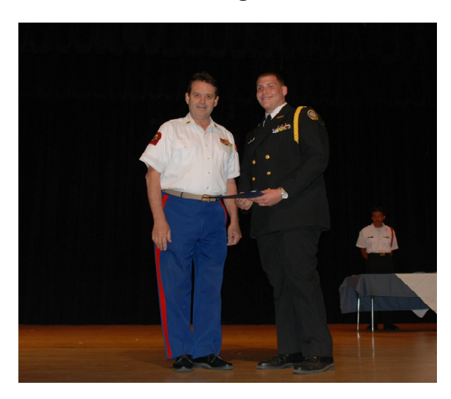
NOVA High School