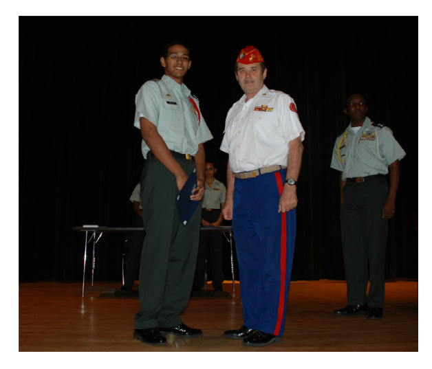
Blanche Ely High School