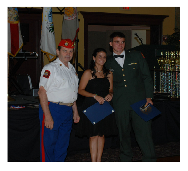
Cypress Bay High School