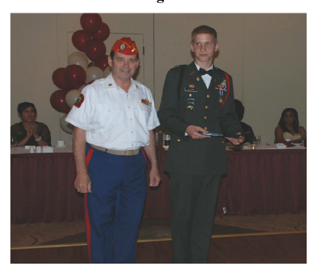
Plantation High School