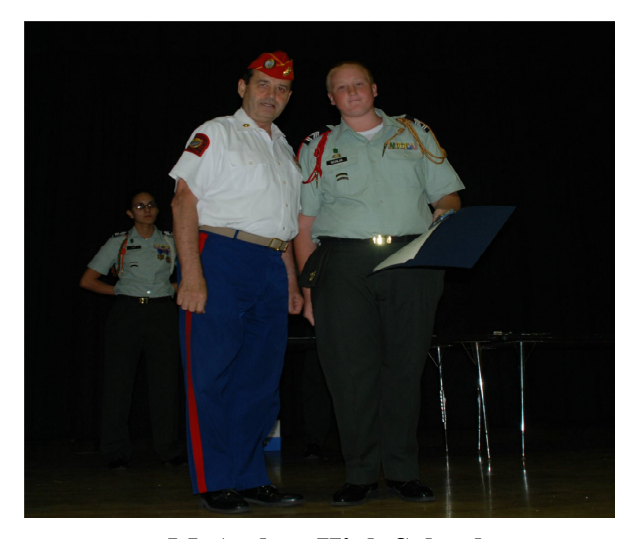
McArthur High School