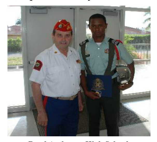
Boyd Anderson High School