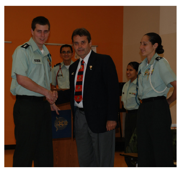
Coral Glades High School