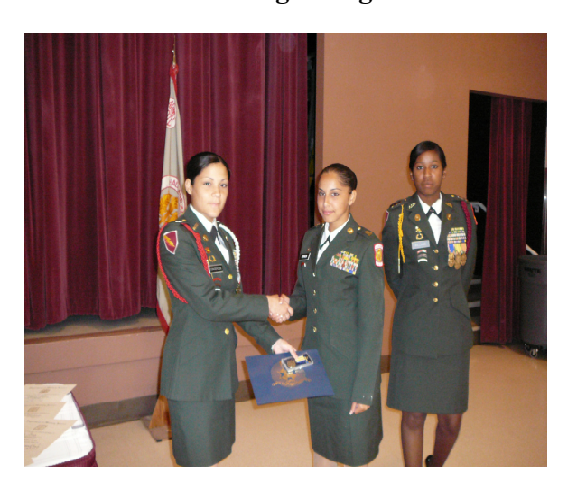
Hallandale High School