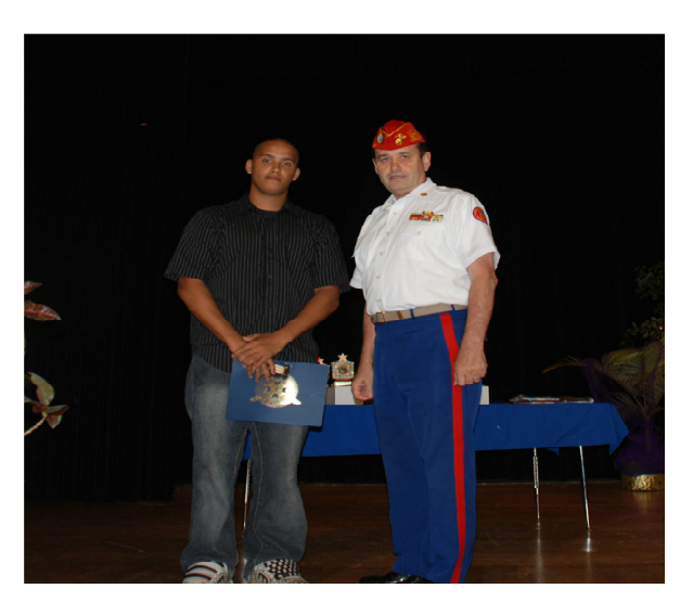
Stranahan High School