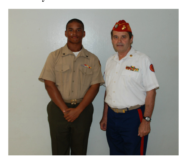
Deerfield Beach High School