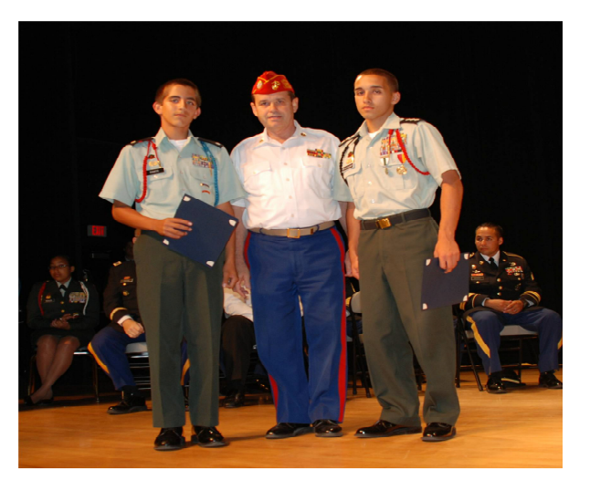
Everglades High School