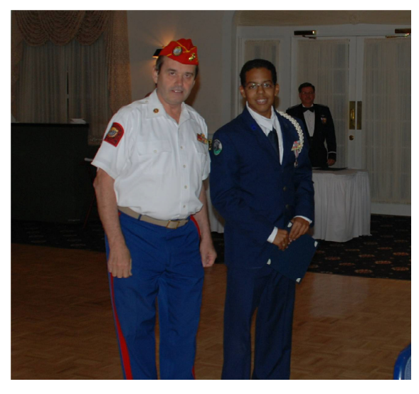
Coral Springs High School