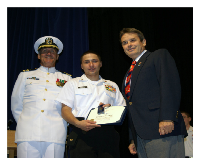
J.P. Taravella High School