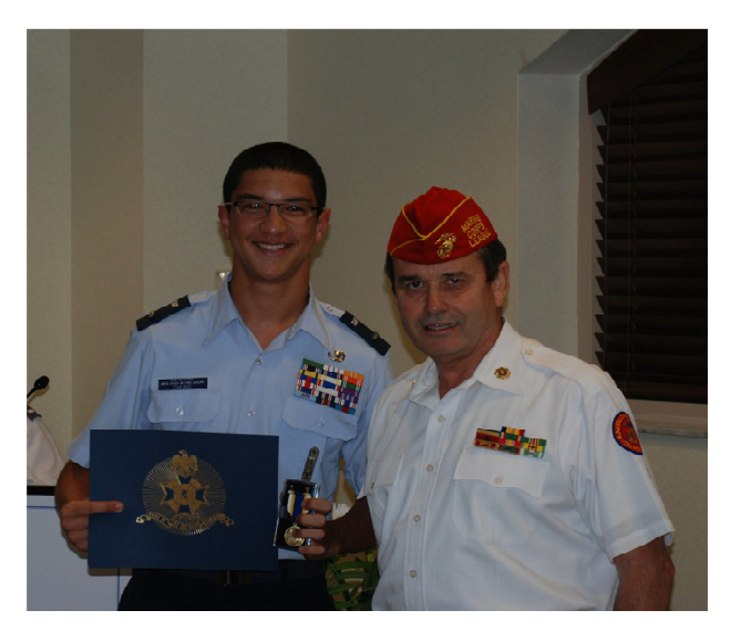
Weston Civil Air Patrol