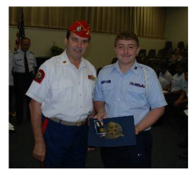
Crystal Lakes Civil Air Patrol