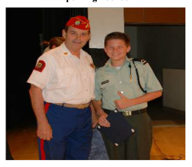
Pompano Beach High School