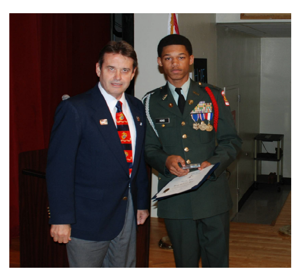
Coconut Creek High School