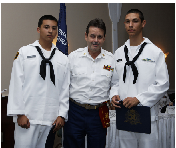
Fort Lauderdale Naval Sea Cadets