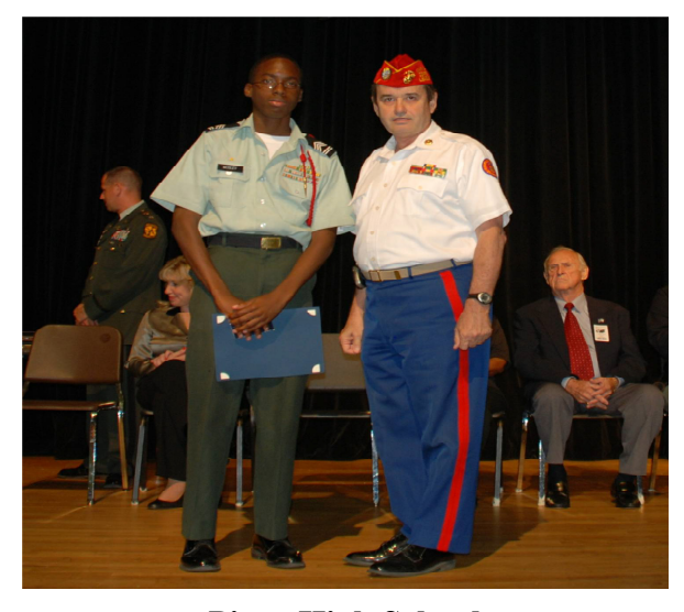
Piper High School