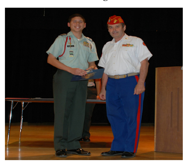
Miramar High School