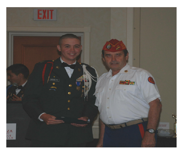
Western High School