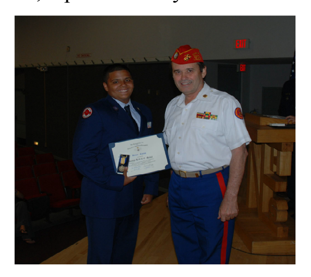
Northeast High School