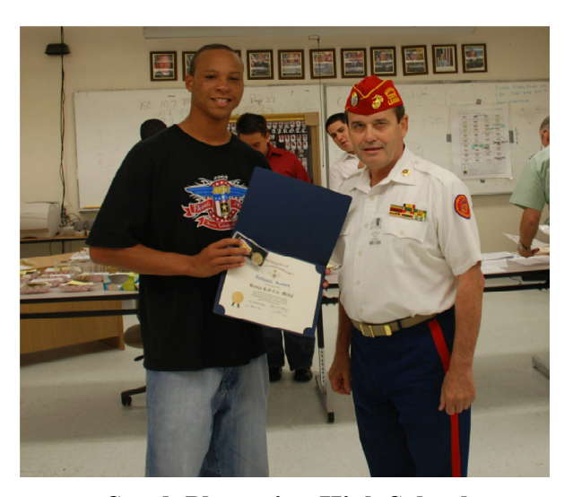
South Plantation High School