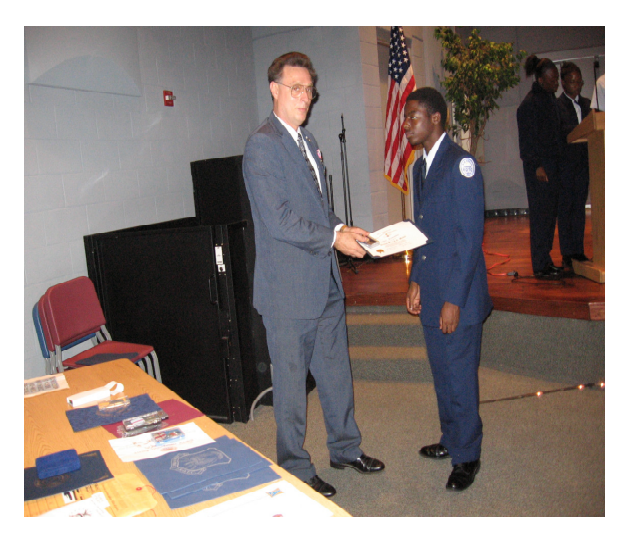
Dillard High School