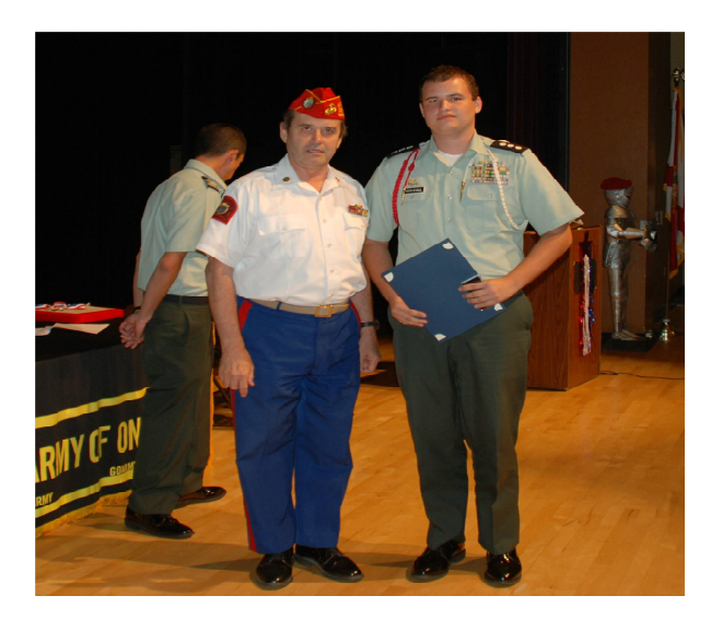
Monarch High School