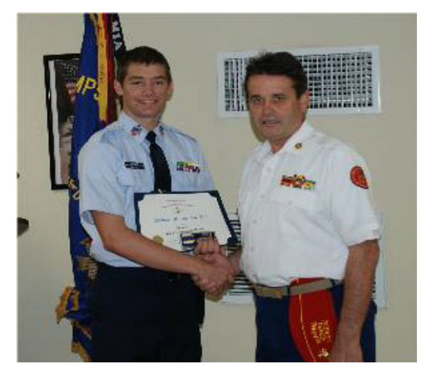
Boca Raton Civil Air Patrol