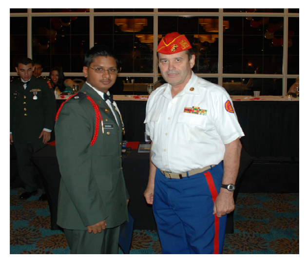
South Broward High School