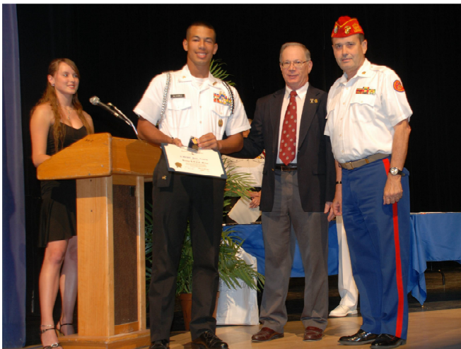
J.P. Taravella High School