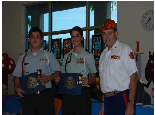
West Broward High School