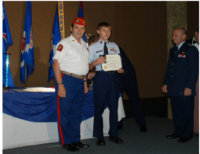
Crystal Lakes Civil Air Patrol