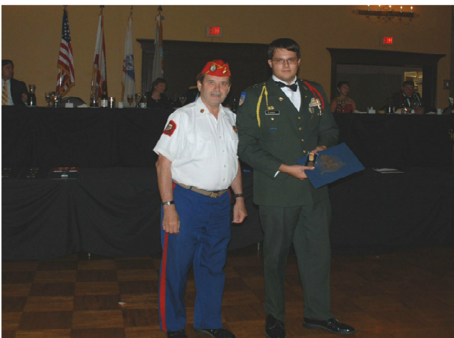
Western High School