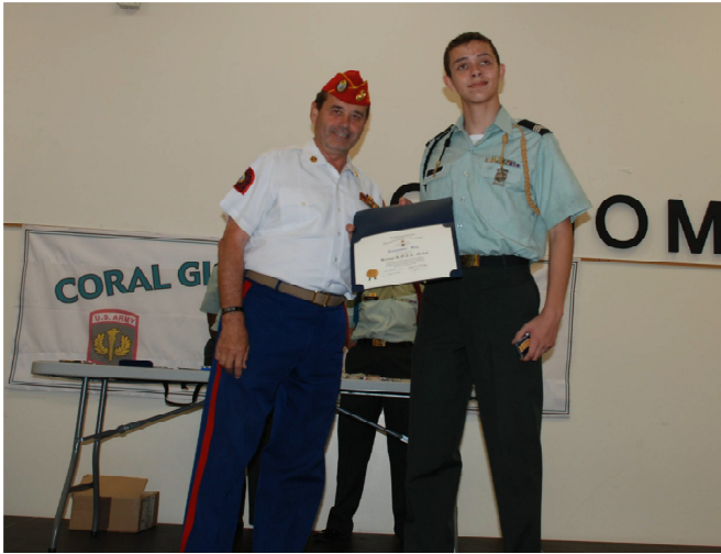
Coral Glades High School