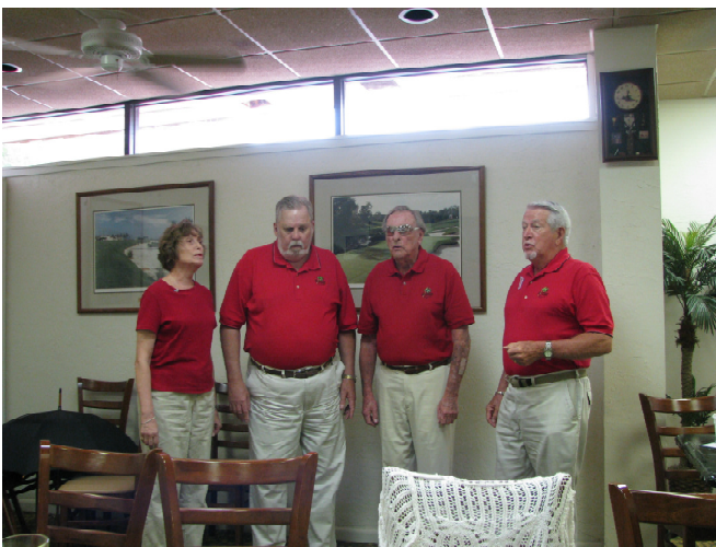
The "Three Hits and a Miss". They sang some songs in the classic barbershop quartet style. Among them were "Under the Boardwalk" and the Beach Boys tune "In My Room".

Below are all our recipients for the past year: