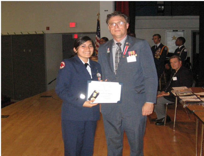
Northeast High School