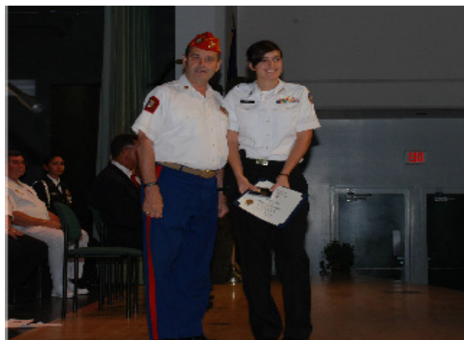
Everglades High School