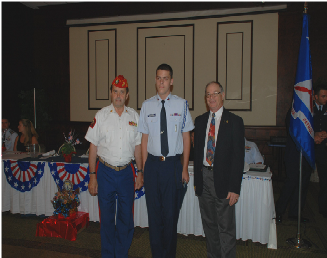
Coral Springs Civil Air Patrol