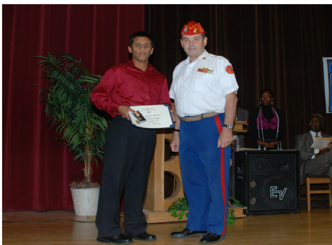
Boyd Anderson High School