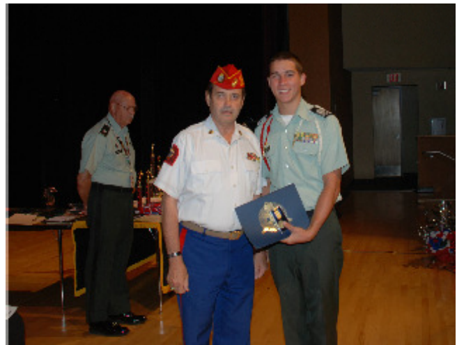
Deerfield Beach High School