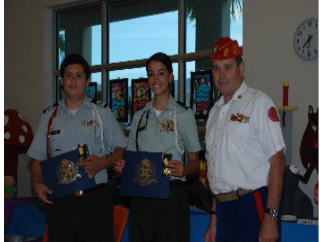
Hallandale High School