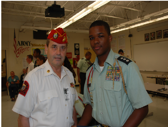
South Plantation High School