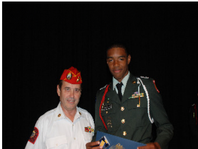
Cypress Bay High School