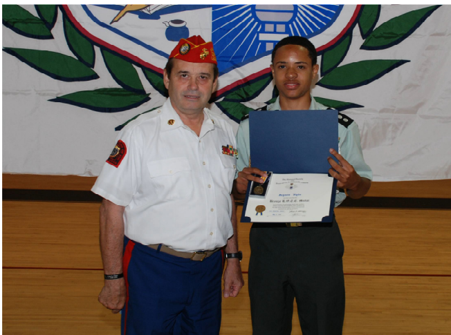
Miramar High School