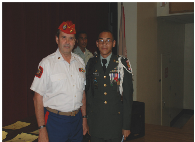
Coconut Creek High School