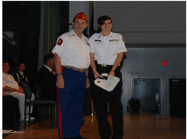
NOVA High School