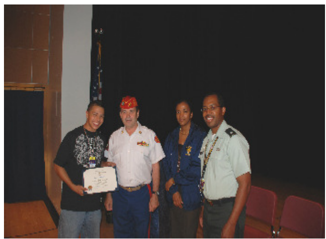
Charles Flanagan High School