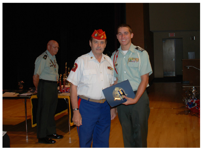
Monarch High School