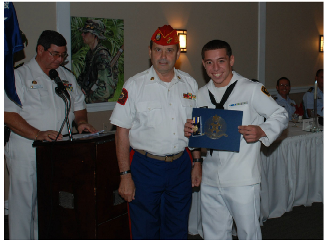
Fort Lauderdale Naval Sea Cadets