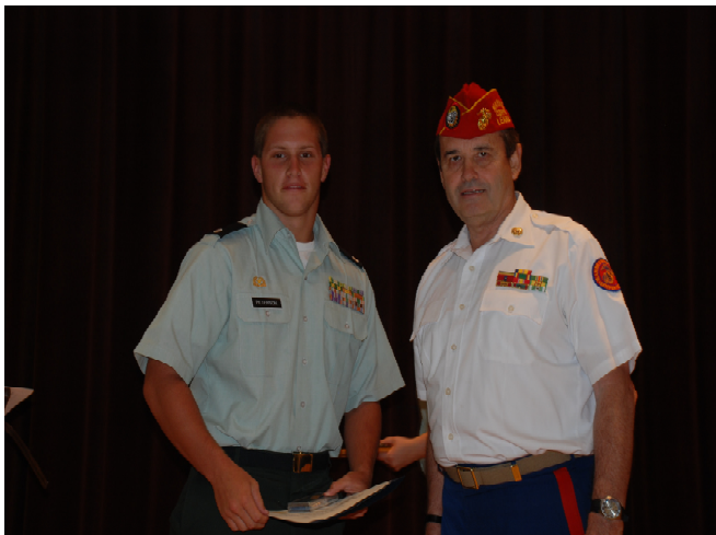
Piper High School