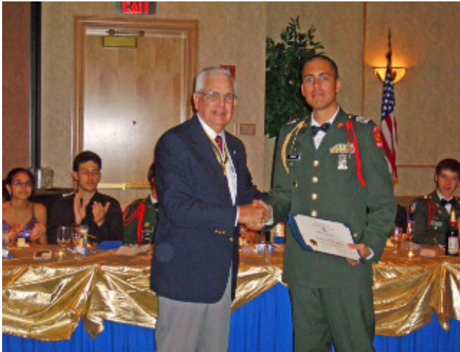
Fort Lauderdale High School