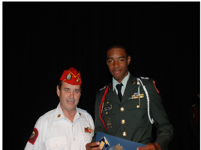
McArthur High School