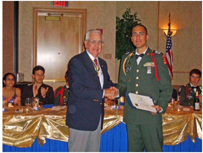
Stoneman Douglas High School