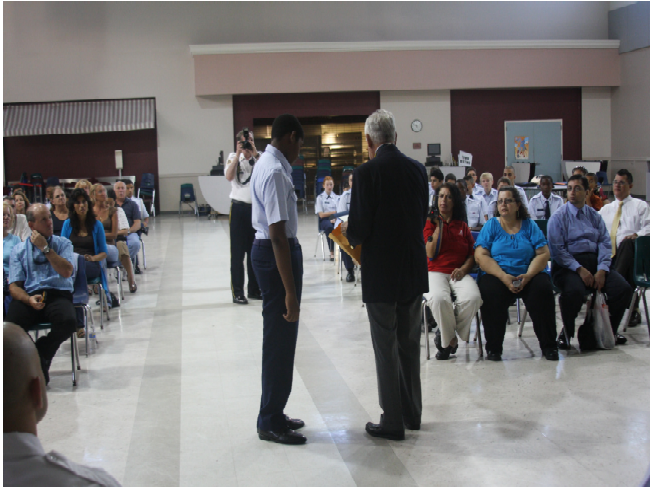
Pembroke Pines Civil Air Patrol