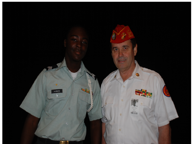
Blanche Ely High School