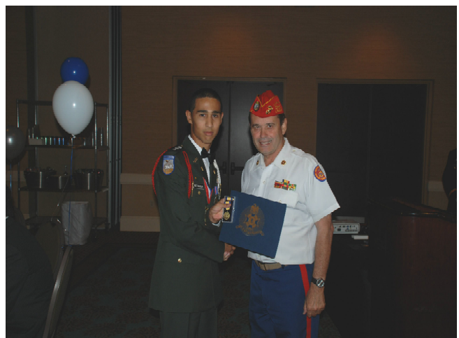
South Broward High School