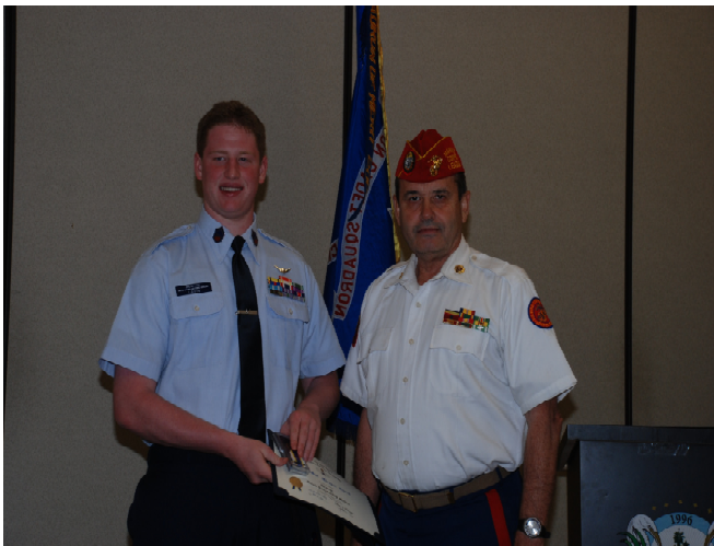
Weston Civil Air Patrol