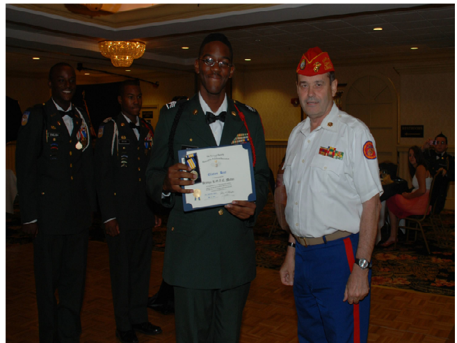
Plantation High School