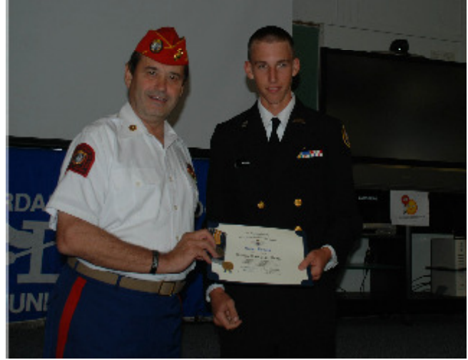
Coral Springs High School