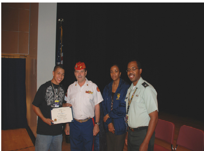
Pompano Beach High School