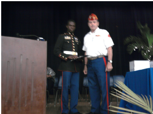
Stranahan High School