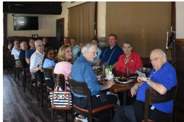
Our July 16 th meeting had 15 members and friends in attendance